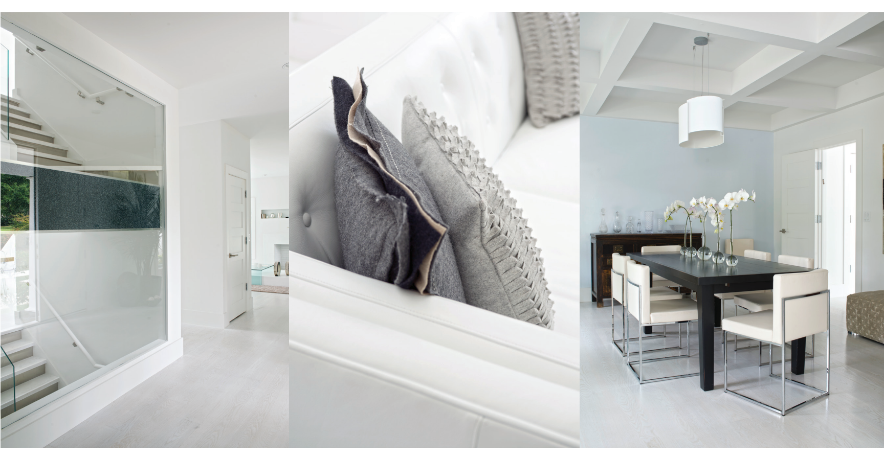
The glass staircase allows for views from the front door all the way through the home to the backyard. In the dining room, Phillip Jeffries's "Lacquered Walls" covers one wall. "The color that I picked was actually a bright white, but it casts a very pale blue—my intention was for it to be white!" laughs Terri. The buffet is an antique.

Together, they settled on a shingled New England Colonial style for the home's exterior, and a more modern interior with an open layout and a palette of stainless steel, concrete, and glass. From there, "it really evolved" says Greenberg. "We started with a basic set of plans, and then all the details—the glass railings, the windows, all the things that make it a special house—kind of came out along the way."