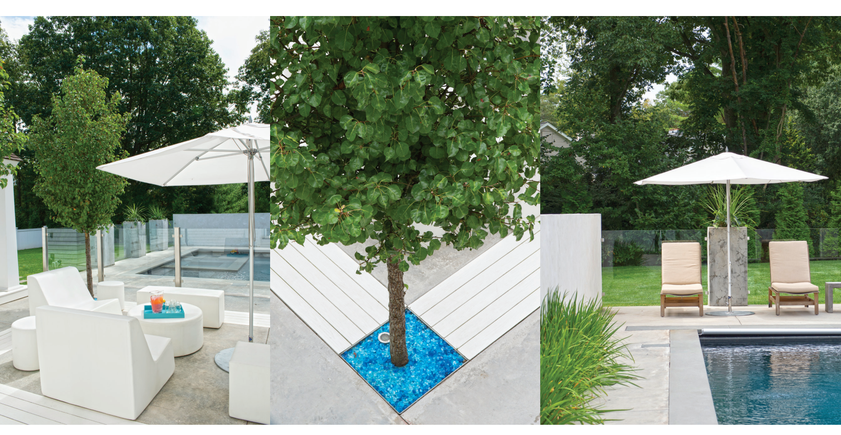
Glass, concrete, and stainless steel are used in the outdoor design as well. A few years in, the grass in the planters was replaced with blue glass. opposite: The seating and dining areas on the "summer patio" are surrounded by white Trex slats that break up the concrete of the deck.

and for two weeks every April, the family enjoys the trees' gorgeous white blooms.